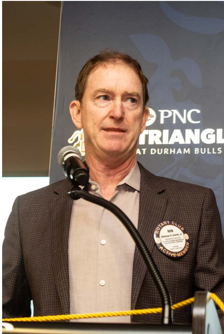
Piano Prelude -- By: Andy Esser